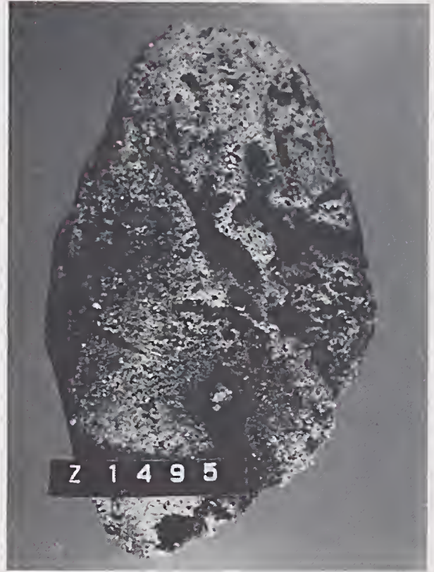
Fig. 5— Acanthostrongylophora ashmorica gen. et sp. nov. Holotype NTMZ1495 (NMVF51374) 150 \times 80 mm.

no. 136, trawl, 84 m depth, 1 Oct. 1983. (Both specimens fragmented).